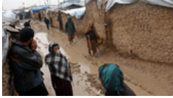
Afghans Flee Homes as U.S. Pulls Back