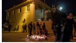
Cities Use Sticks, Carrots to Rein In Gangs