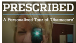
Prescribed: A Personalized Tour of 'Obamacare'