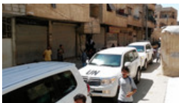
Syrian Regime Blocks Food to Gassed Town