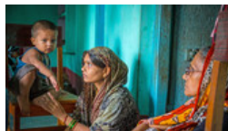
In India, Rapist's Wife Faces Harsh Sentence