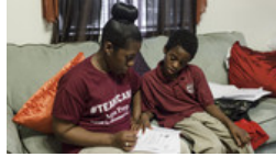
Inside the Nation's Biggest Experiment in School Choice